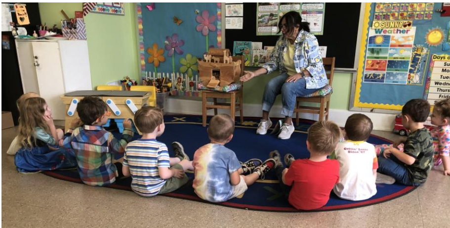
**** 3 YEAR OLD CLASS LEARNS ABOUT NOAH'S ARK****

New food training rules are in place for Saturday Lunch to satisfy our insurance policy directive. Copies of the session minutes are in the church office.