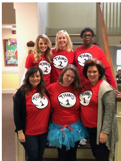
Day School Teachers & Staff