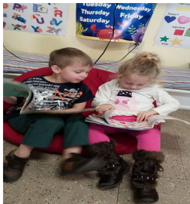
Day School Students learning to read

Please remember our VIPs in prayer each week and drop them a card or note