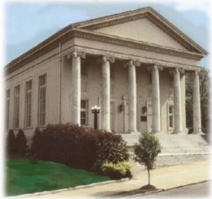
Celebrating 185 Years of Knowing Christ and Making Him Known

THE COLUMNS OF THE First Presbyterian Church 937 Main Street, Danville, Virginia 434-792-7822