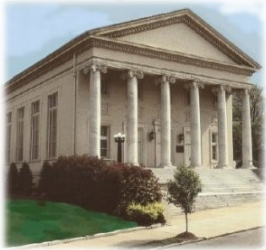
Celebrating 185 Years of Knowing Christ and Making Him Known

THE COLUMNS OF THE First Presbyterian Church 937 Main Street, Danville, Virginia 434-792-7822