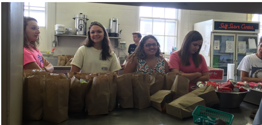
Youth assisting with Lunch ministry

Your Missions Committee is also supporting Cross Road Christian Counseling with goods for their Truth House. See the box in the Sutherlin Entrance with their needs written on note cards; your gifts are truly needed and appreciated