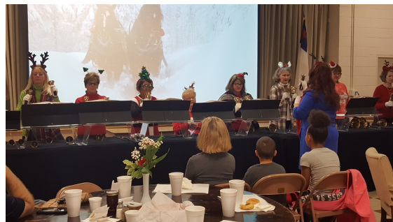
Handbell performance Dec. 13th