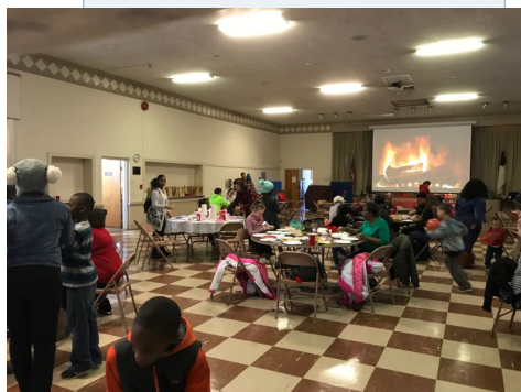
Angel Tree Ministry Party

You can reach us at (434) 792-7822 or office@fpcdanville.com