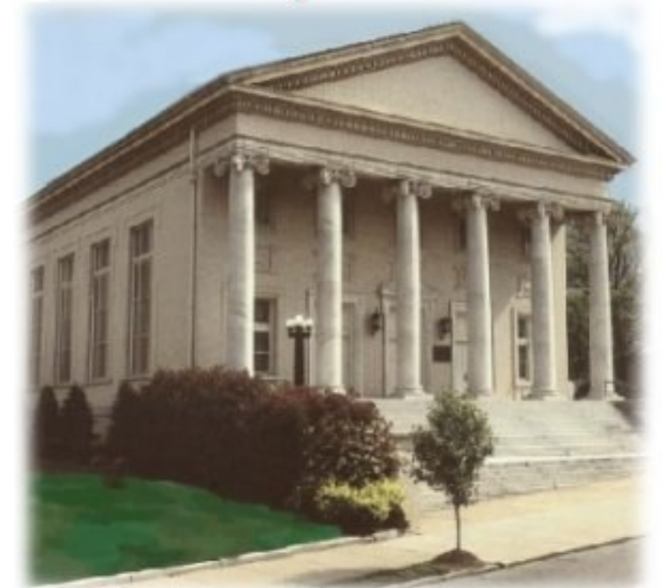
Celebrating 189 Years of Knowing Christ and Making Him Known

937 Main Street, Danville, Virginia 434-792-7822 www.fpcdanville.com