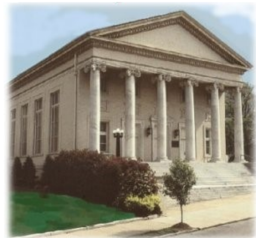
Celebrating 185 Years of Knowing Christ and Making Him Known